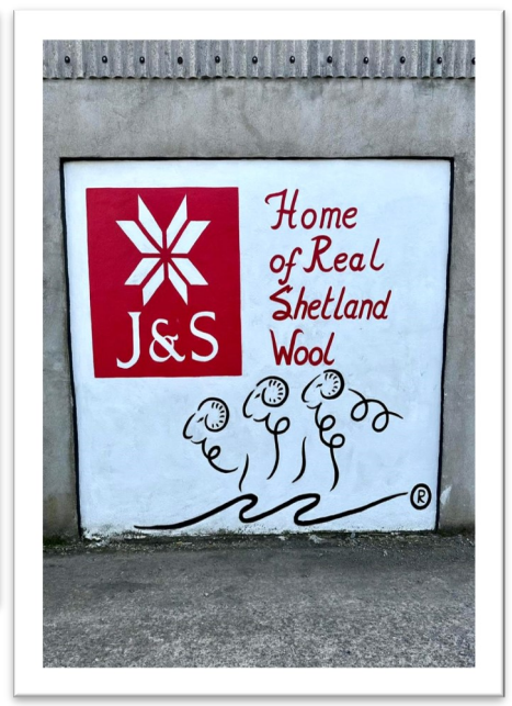
with Amy Detjen & Heather Black 26th September to 07th October